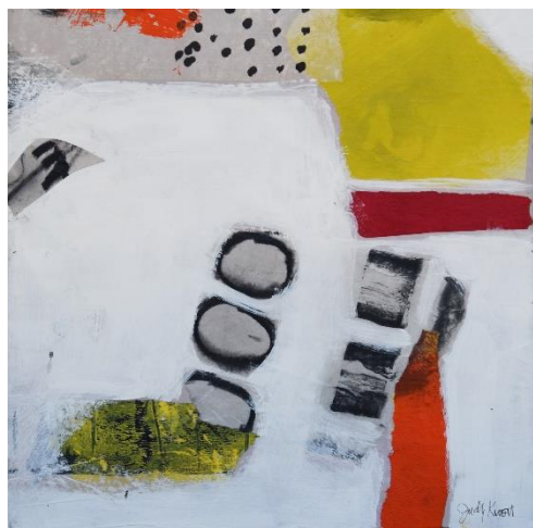
FPickled Tangerines 8 x 8 mixed media